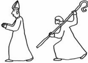
CARRYING THE BISHOP'S CROZIER AS IT CAN GET QUITE HEAVY AFTER A WHILE