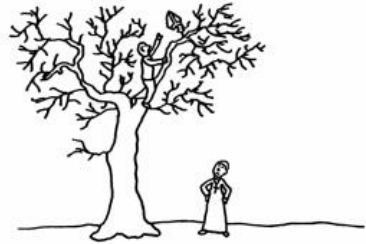
CARRYING OUT MISCELLANEOUS TASKS AS AND WHEN REQUIRED